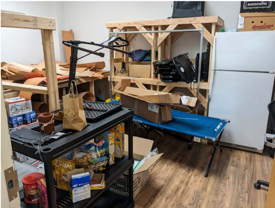
Figure 8 - Retail space office/storage, approximately 110 sq.ft.