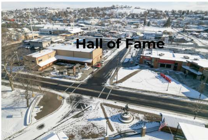
Figure 5 - Aerial view from above Round-Up Arena across the street