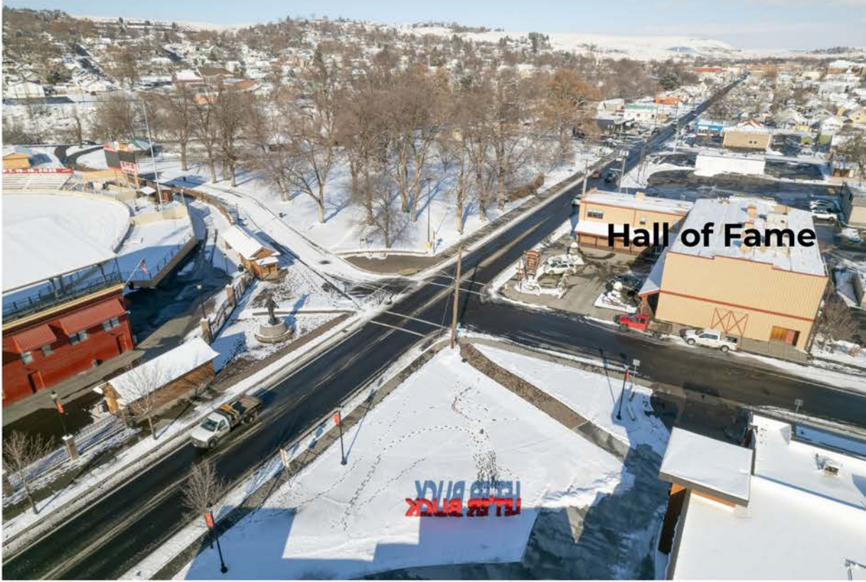
Figure 4 - Centennial Plaza, with Round-Up & Happy Canyon Administrative Office and Retail Store to the west, Roy Raley Park to the north, and the Pendleton Round-Up Grounds main ticket gate to the northwest.