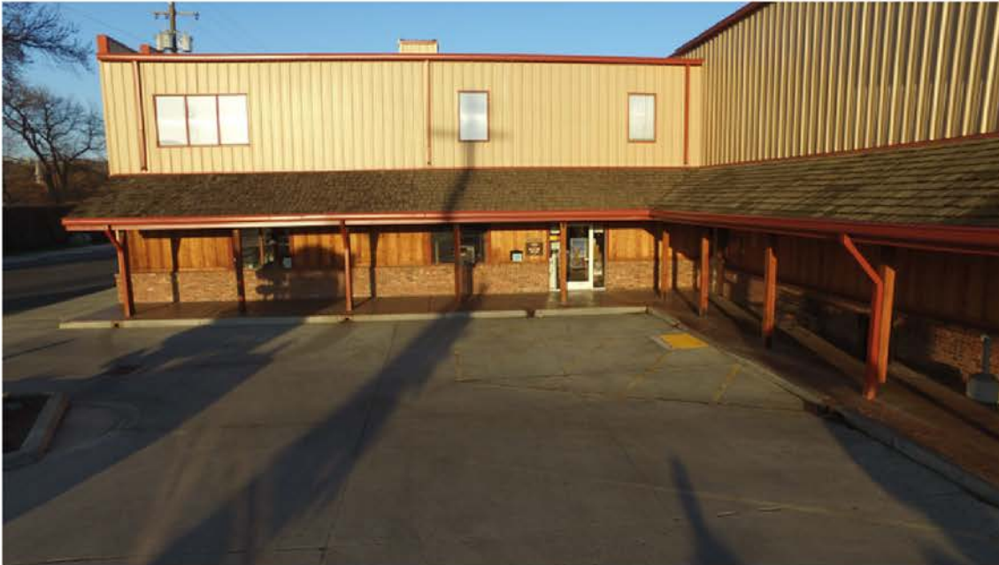
Figure 6 - Retail space storefront, taken from building parking lot