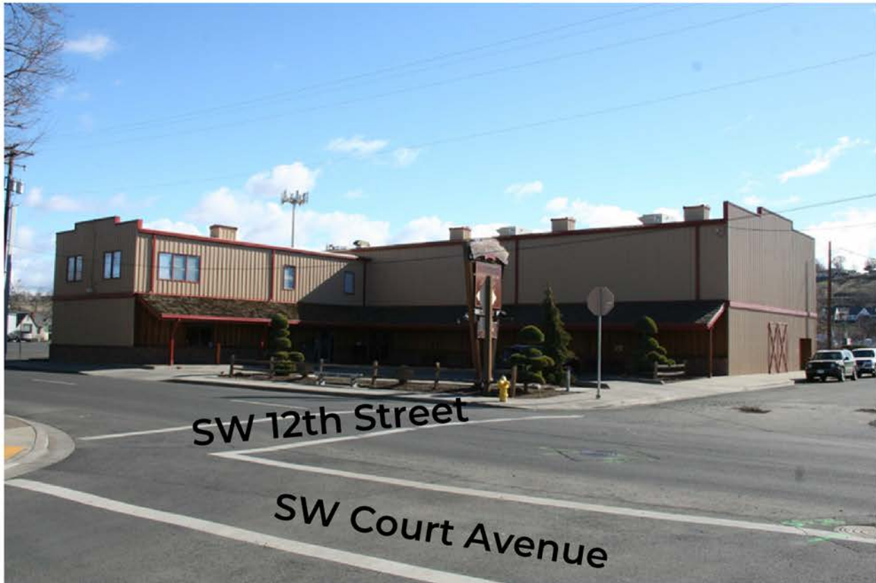
Figure 1 - Hall of Fame building; photo taken from Let 'er Buck statue in front of Round-Up Grounds on SW Court Avenue, across the street