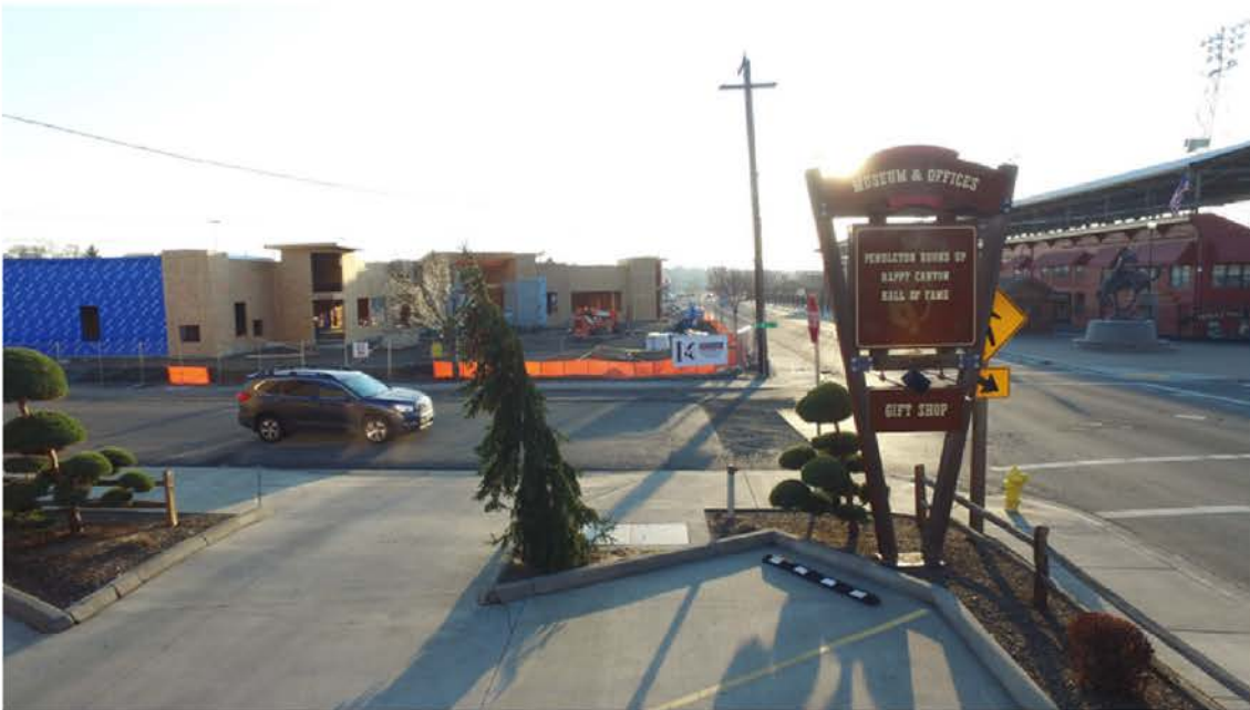
Figure 7 - View from retail space storefront, looking at corner of SW 12th Street and SW Court Avenue, with Round-Up & Happy Canyon admin offices/retail store across SW 12th Street (construction completed in 2020).